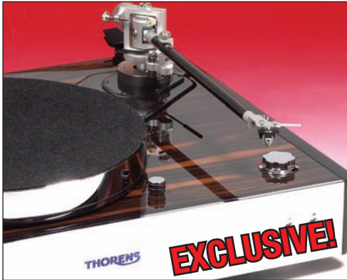
THORENS TD550 ultimate turntable

FREE READER CLASSIFIED ADS IN THIS ISSUE!