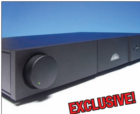
NAIM NAIT XS integrated amplifier