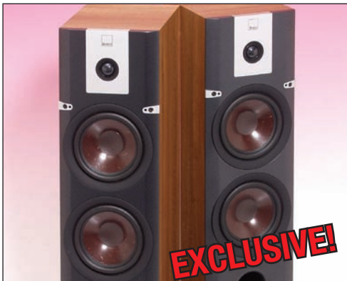
DALI LEKTOR 6 loudspeakers